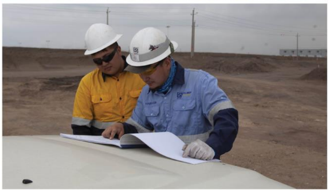
Figure 1 – Commissioning activities at the Gurvantes XXXV CSG Pilot Well Program