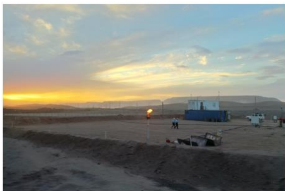
Figure 1 – Lucky Fox 1 Pilot Production Well

These pump shutdowns do somewhat delay the time required to deliver a potentially commercial flow rate as each time a pump shuts down for an extended period of time, the fluid level in the affected well increases significantly, requiring the drawdown process to start again once the pump is back online. However, as the dewatering process advances, the fluid levels can be drawn down more rapidly than the initial draw-down process.