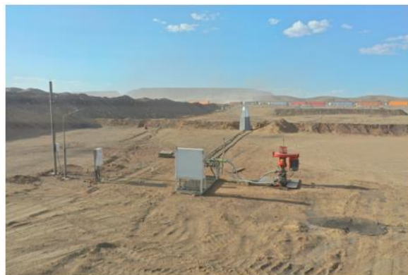
Figure 2 – Lucky Fox 2 Pilot Production Well